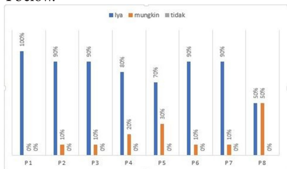
Figure 4 The ECE Teacher Opinion

The ECE teachers were also asked to participate in giving their opinion toward the model had been practiced for the evaluation aspect. The positive opinion will be meaningful for developing the model in wider usage scope. Their responses was tabulated in the Figure 4 below.