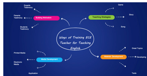
Figure 2 Model of Simulation

English with simulation strategy was done by involving 10 ECE teachers. At the first meeting, they were trained with some strategies suitable for introducing English at ECE. The material concerning with the various techniques were available and practiced with a fun and joyful. They were also introduced with the media which were applicable for ECE learners and easy to develop. The detail of simulation strategy of teaching English for ECE teachers as described in Figure 2 below.