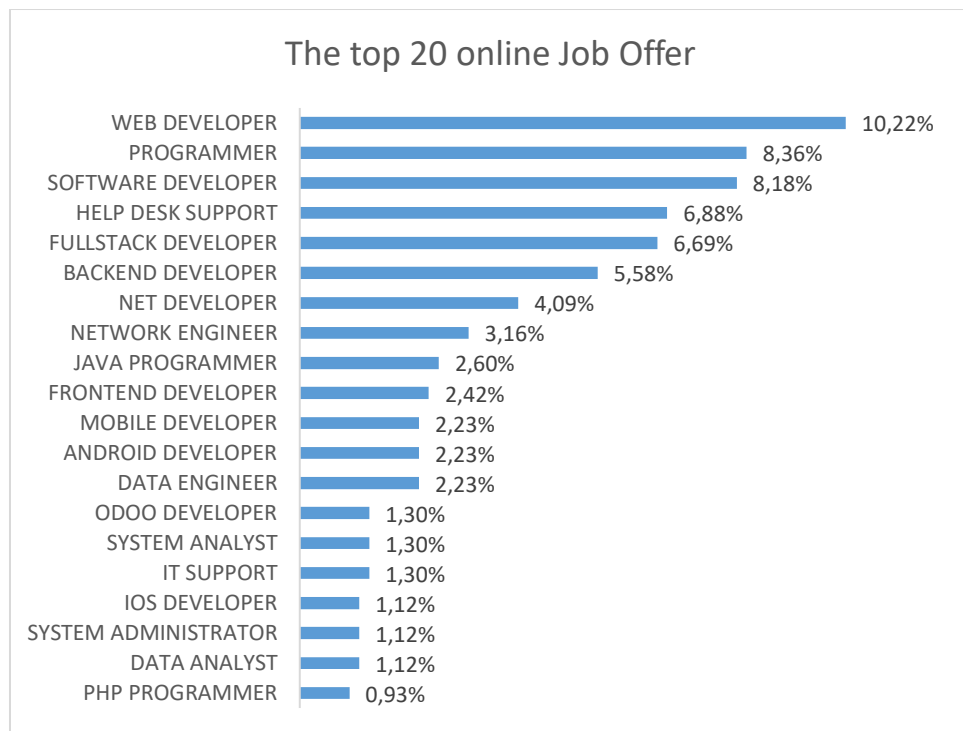
Figure 2 The top 20 online positions offered by employers

Other jobs that are not closely related to creating program code or software development are System Administrator, Help Desk Support, and IT Support. These jobs are very instrumental in the smooth running of company activities or software development activities. Another job that is also included in the top 20 is Network Engineering which plays a role in handling computer networks.