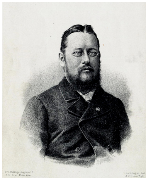
Figure 1. A portrait of Carl Bock, published in the 1883 Norwegian edition of his travel account, Hoved-jægerne paa Borneo (Bock 1883).

one in Dutch and the other in English, each designed for a different audience and addressing different concerns. The analysis thus follows the insight of Mary Louise Pratt, that the explorer’s discovery “has no existence of its own” and “gets ‘made’ for real after the traveler [...] returns home, and brings it into being through texts” (Pratt 1992: 204). Beyond that, however, Bock’s parallel accounts provide solid evidence that not only does the textual encounter have primacy over the “real” one, but moreover it is actively and consciously shaped and reshaped in the editorial offices during the publication process to meet changing audience expectations and political goals.