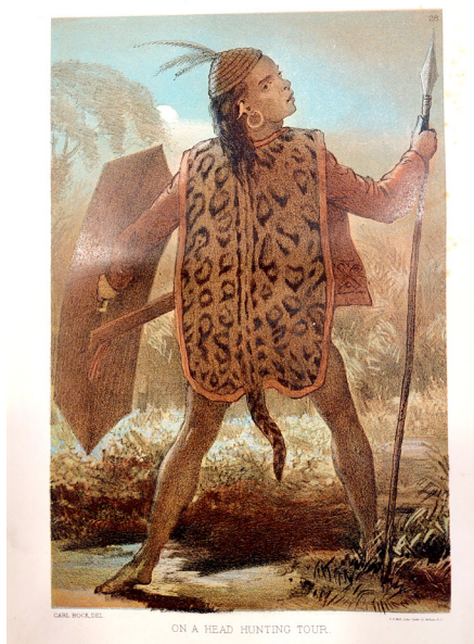
Figure 3. “On a head-hunting tour”. Lithograph based on Bock’s original drawing, published with his 1881 English-language travelogue.

While the concrete details of these encounters are more or less exactly the same in both versions, the English deliberately provides space for internal monologues and speculation that opens up the possibility of danger, of any moment turning unexpectedly into violence, as befits the Dayaks’ bloodthirsty reputation (Figure 3). Moreover, it effaces specific thoughts and statements that Bock ascribes to himself in the Dutch, which serve to dispel any acute sense of danger in the latter version. It is not immediately obvious what interest Bock would have had to downplay the threat in the Dutch report, if not to simply emphasise his own intrepidity as an explorer. Clearly, however, his London publisher felt such a framing was less than optimal and opted instead for a far more open-ended and sensationalist approach to the dangers of exploration in the English version.