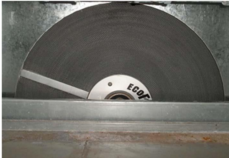
Figure 1. Heat recovery wheel