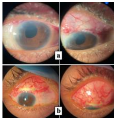
Figure 3. Postoperative Clinical Pictures Showed A Good Bleb Morphology. A) One Day After Surgery. B) One Week After Surgery.

Subconjunctival Bleeding. The Graft And Sutures Were Intact On The Conjunctiva, And Other Anterior Segment Examinations Were Consistent With The Previous Findings. On The First Postoperative Day, The Patient Was Allowed To Be Discharged With Continued Oral And Topical Therapy, Including The Addition Of Timolol Maleate 0.5% Eye Drops Twice A Day In Both Eyes. The Patient Was Advised To Have A Follow-Up Appointment At The Glaucoma Clinic 7 Days Postoperatively.