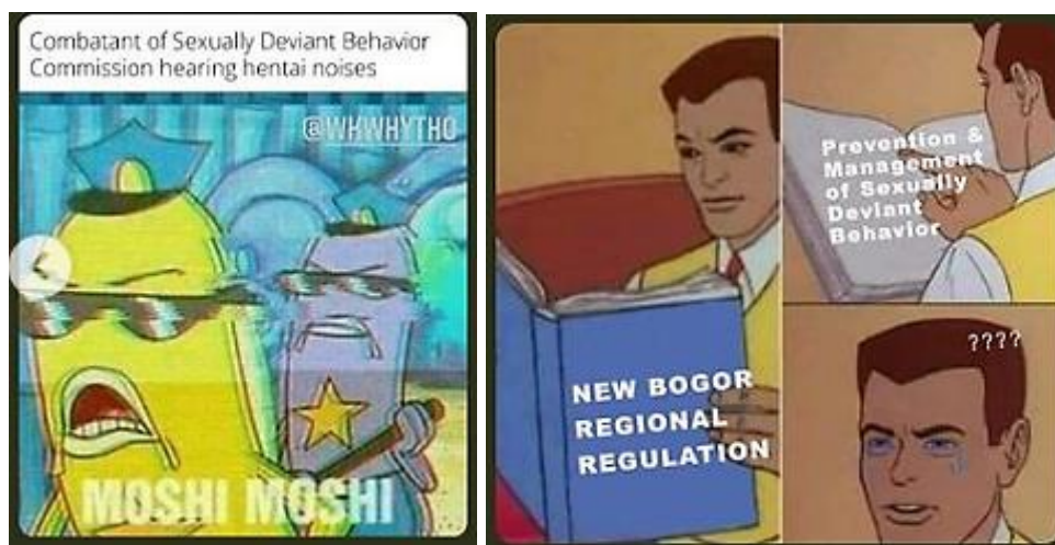
Figure 2. Humorous memes in Bogor’s Regional Regulation on “Sexually Deviant Behavior”: Accused of Being Discriminatory towards the LGBT Community (2022a)