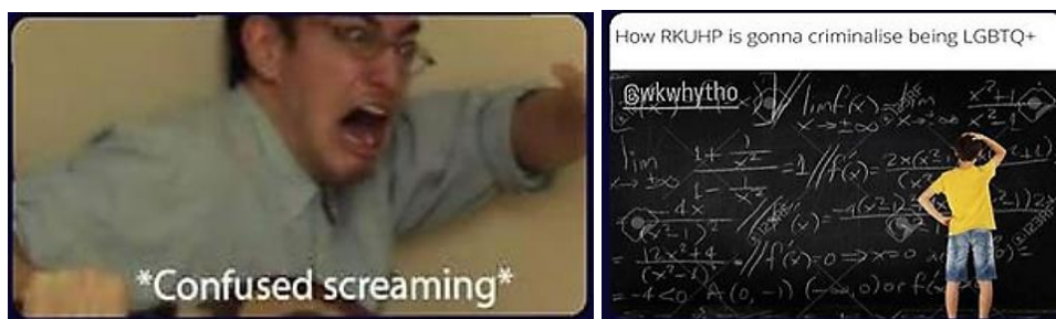
Figure 1. Humorous memes in Is the RKHUP Really Going to 'Criminalize LGBT'? (2022b)

Unlike the first post, the humorous memes in the Bogor's Regional Regulation on "Sexually Deviant Behavior": Accused of Being Discriminatory towards the LGBT Community (2022a) post are more complex. The memes