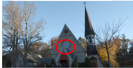
Picture 11. A Salib

The scene shows Craig and his father going to church together. They pray guided by the priest. Then Mr. Harrigan came in while everyone was praying. Craig was then chosen by the pastor to come forward to recite the prayer. The type in that scene is symbolic. The symbol is a sign that has been mutually agreed upon. The symbol in the scene is a plus sign on the building. Based on the mutual agreement, the symbol implies a symbol of a religion, namely Christianity.