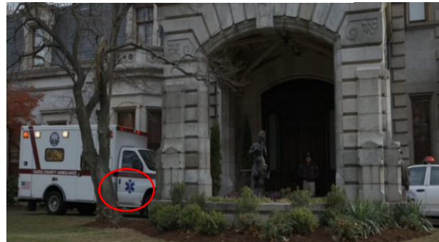
Picture 15. Medical Logo

The scene show Craig is heading to Mr. Harrigan's house. Afterwards he rang Mr Harrigan's doorbell, because no one opened the door he finally decided to go inside. He was surprised to see Mr Harrigan's not breathing. He finally panicked and tried to call his father. His father tried to calm him down and immediately called an ambulance. The ambulance and police came to Mr Harrigan's house to take him to the hospital. The type of the scene is symbol. The symbol is a sign that has been conventional. The symbol in this scene is the symbol of a snake on an ambulance. This symbol is a symbol that has been mutually agreed upon and has been designated as a symbol for medical personnel.