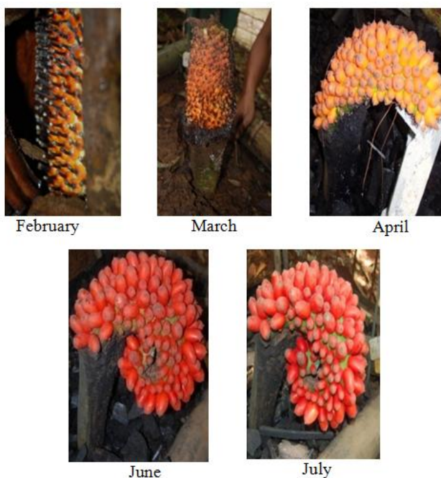
Fig. 3. The development of A. titanum fruit up until harvest in July 2013, after hand pollination in February 2013.

We did not expect the outcome of hand-pollination to be detectable within the first week. On 22 nd February 2012, approximately three weeks after pollination, the infructescence was reddish-yellow, and by the next month the tips of the styles had dried and shrunk. One month later, as shown in Figure 3, the bases of the styles had expanded and the successfully pollinated pistils were orange in colour while those not successfully pollinated had decayed. In the second month after hand pollination, part of the infructescence was infected with a fungal rot.