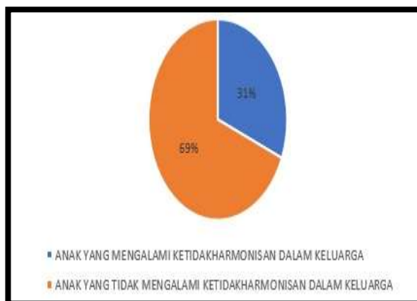
Picture 1. Comparison of students in terms of parental disharmony

the data provided seems to be able to be covered with theoretical evidence so that researchers believe the data can provide an overall picture of the learning process in the school. Comparative data, of course, still have to be explored further and in depth, but the initial data that the researcher found, namely the comparison of children who experience disharmony with their parents and vice versa, can be seen in Figure 1.