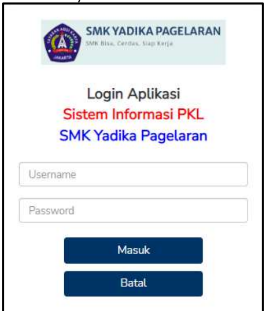
Figure 3. Interface Login

Login is the page that first appears when the user / admin opens the system. To enter the user / admin system it is necessary to enter a username and password.