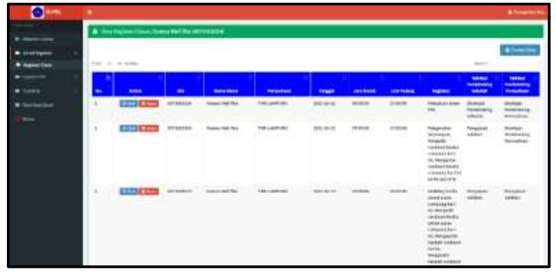
Figure 4. Interface Student Activities

To obtain a feasibility study from the fieldwork practice information system, testing was carried out using calculations from black box testing as many as 45 questions to 6 respondents, the following results were obtained: Result = \frac{270}{270} \times 100\% = 100\%