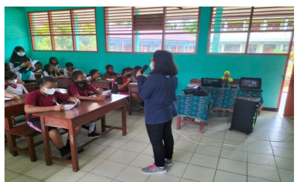
Figure 2. Education About eye health

Besides that, the team's devotion to the Public Advocates is the principal, so this relaxation combination eye exercise becomes a routine program carried out by the school. After one month of observation and follow-up on eye exercise activities routinely carried out by the school. Participants were very enthusiastic to follow activities seen to change knowledge before being given an education that knows, with the lowest score of 10 as many as 2 participants. After being given education experience improvement, with the lowest score of 40 as many as 1 participant, this shows that education successfully exceeds the target achievement.