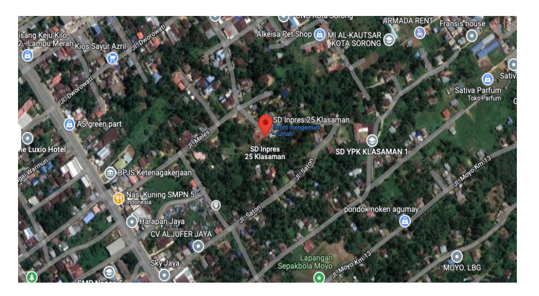
Figure 1. Activity location map