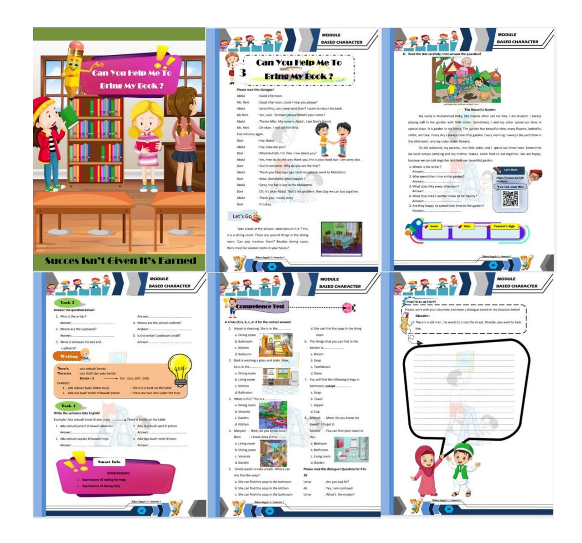
Figure 3. The main activity content of English module