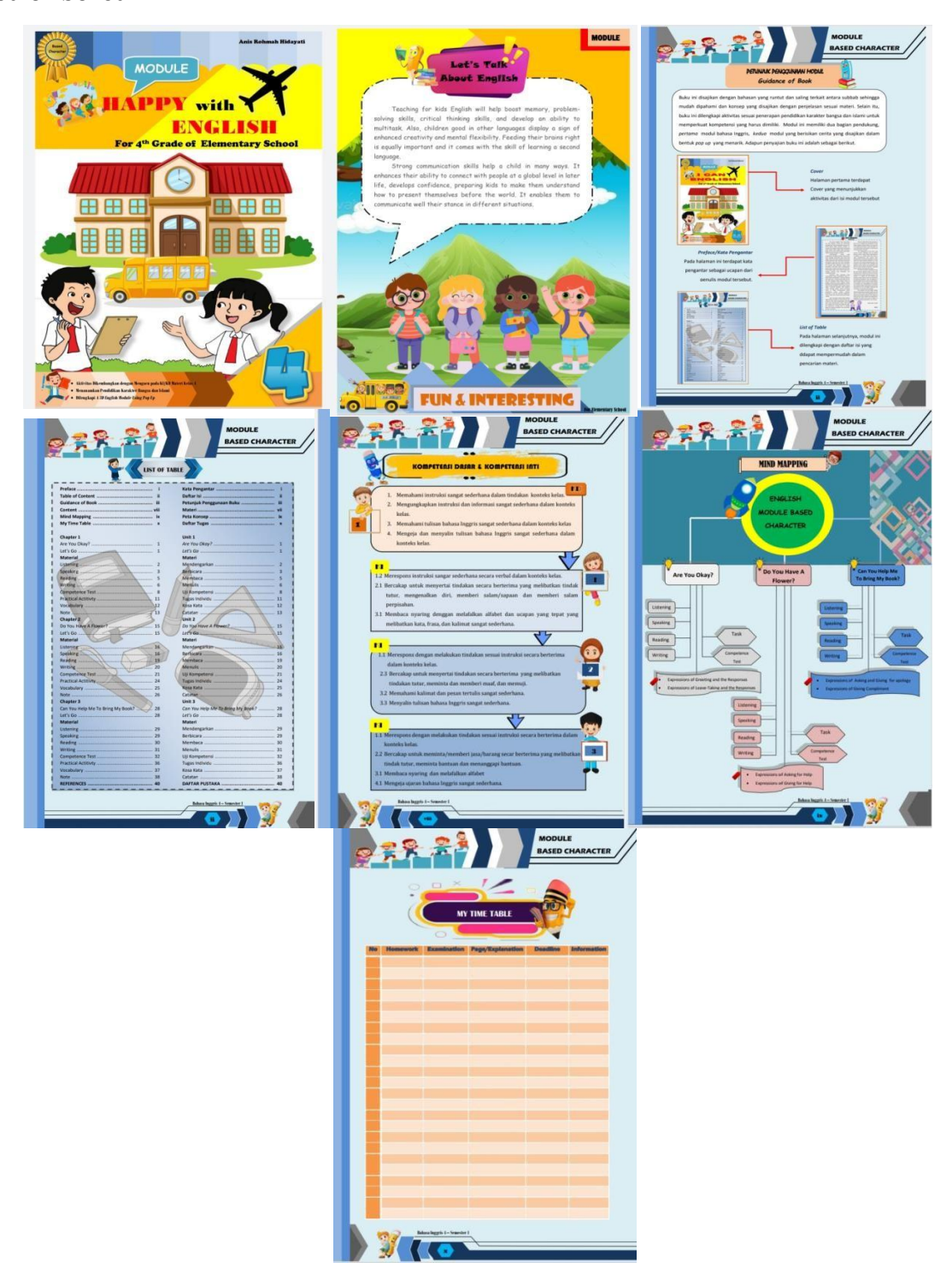
Figure 2 . The Pre-activity content of English module

understanding. All the compositions on the module are organized in accordance with the layout, so they are balanced on the matter with other compositions. Description of the contents of the module using A4 paper using Calibri, Times New Roman and Comic Sans fonts in sizes 11,12, and 14. The Pop Up book useCalibri and Comic Sans fonts with sizes 12, 13, 14, and 16. Using A4 paper, that kind of paper is ivory. any part of thecontents of books and pictures in design attractively. When children read the material, they are not tired or bored.