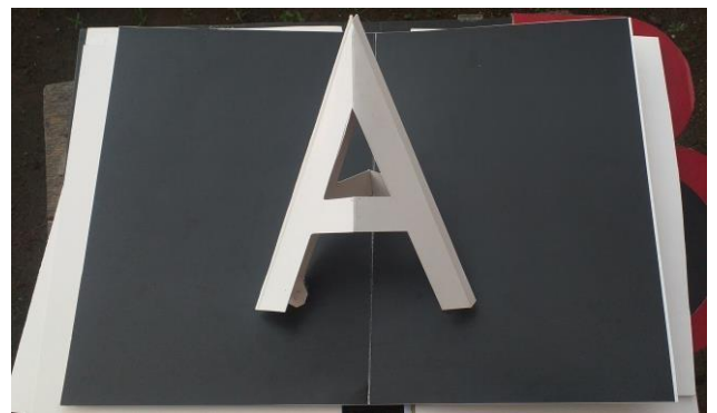
Figure5 . The pop up book