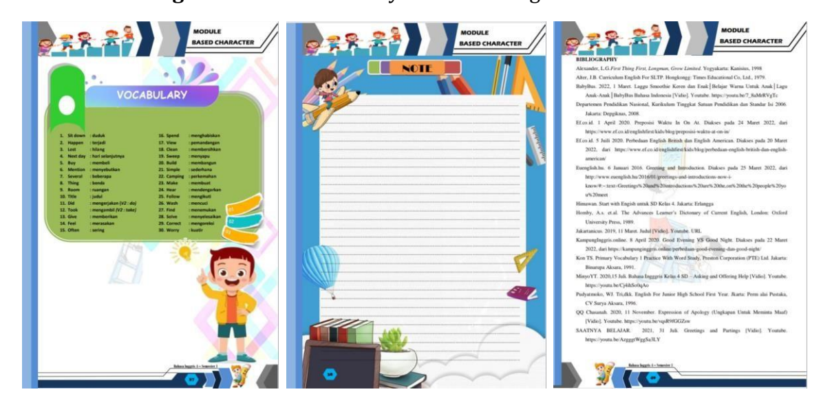
Figure 4. The post-activity content of English module