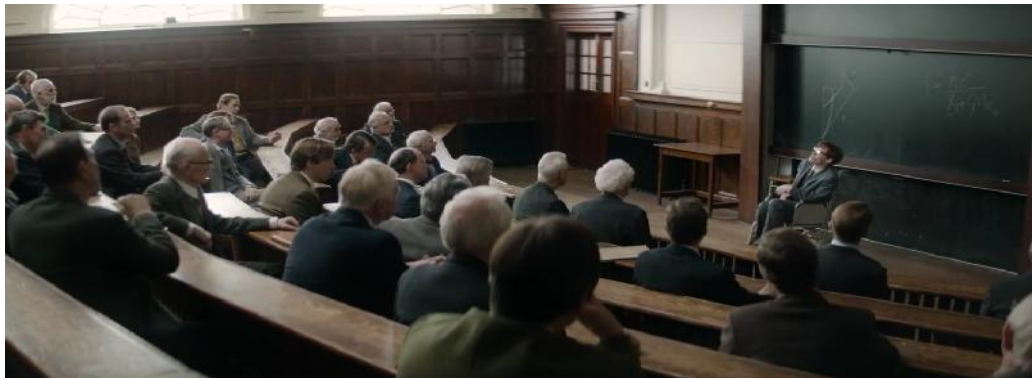
Source: The Theory of Everything Movie