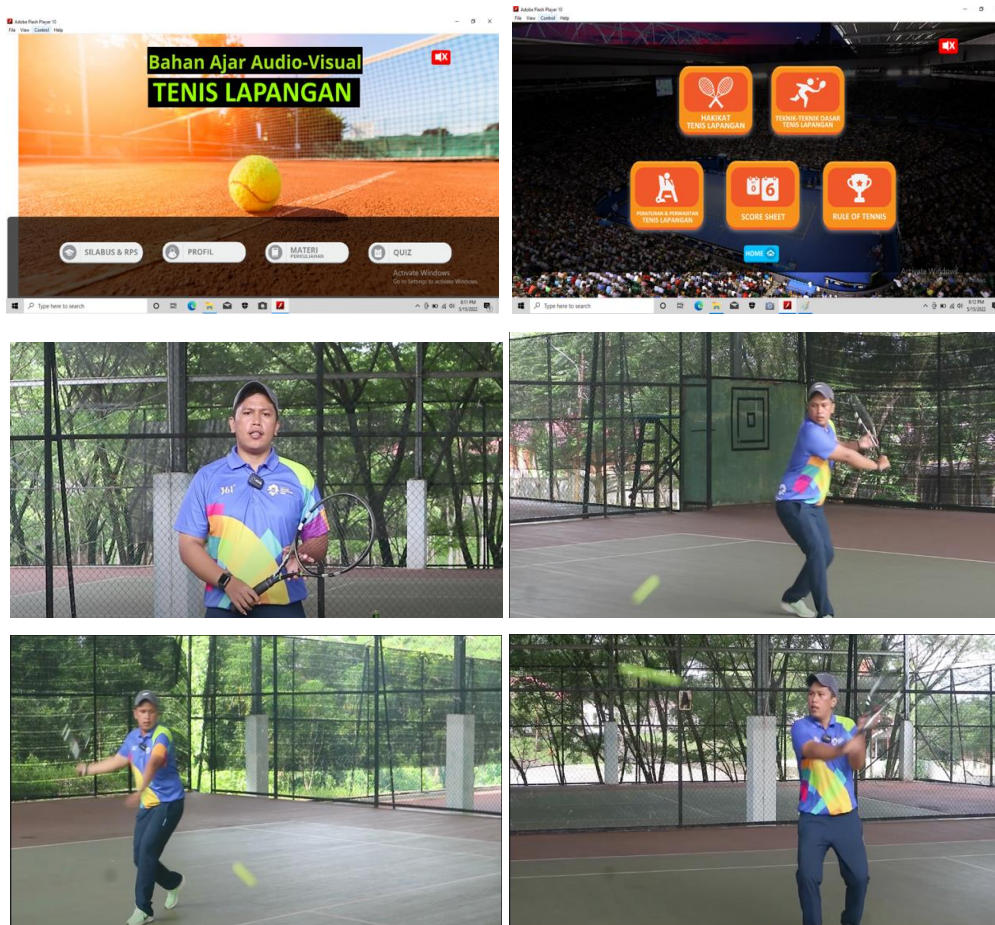
Figure 2. Display of Audio Visual Teaching Materials for Tennis Field Learning

The results of this research are audio-visual teaching materials for tennis learning. As explained in the method chapter, this audio-visual teaching material needs to get user feedback and ratings. The following is an example of the display of audio-visual teaching materials for tennis learning.