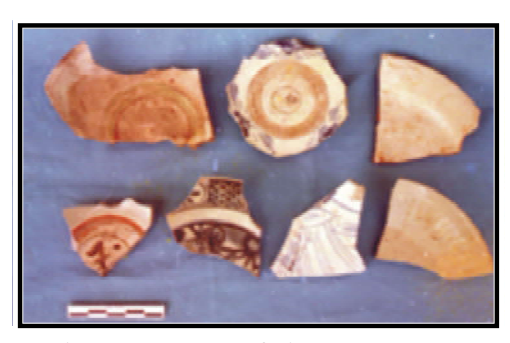
Plate 4. Remnant of Chinese ceramics

In NW quadrant was found a well-maintaned terrace mound built in 1997. Another three-terraced mound was found on the yard of Ardiansyah's house; it is a