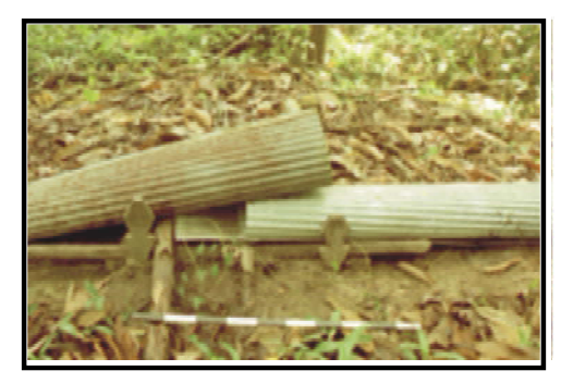
Plate 2. Burials in Murung Kelawen

of soil. A number of rarung mounds were found in their natural form covered with vines and grown by huge trees; therefore, the shape and size of the rarung mound cannot be measured (Plate 2).