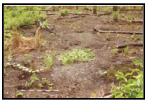
Plate 3. Location of mapuy on SW quadrant

(13th-14th century), Ming (15th-16th century) and Qing Dynasty (17th-18th century). Among the 113 fragments, 43 pieces or 38.05% is identified as Swatow-ware dated from the 15th-16th Century, and 1 blue-white bowl produced by the Fujian (or Guangdong) during the 17th-18th Century. Observation on ceramic profiles indicated their original shape of: (1) open containers i.e. bowls, plates, large and small saucers, glass, and jar cover; and (2) closed containers consisting of big and small jars.