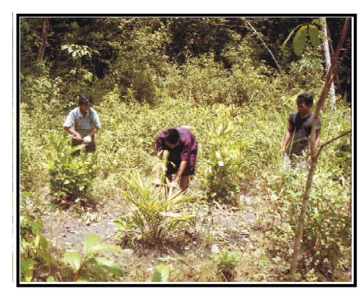
Plate 1. Haringen site

social environment. Such information may help to understand the process of cultural transformation which had been formed and we know today. The overall result was used to answer questions on the form of burials in the research area.