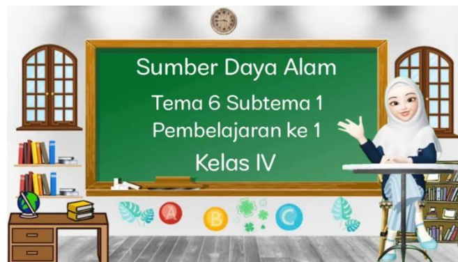
Figure 1: Example of the display of animated video results

According to Munir (2013: 327) said that the development of animation, now animation has several types of characters in its animated objects. The following are the types of animated characters: (1) 2D (2 Dimensional) or two-dimensional animation, known as flat animation. (2) 3D animation (3 Dimensions) is a development of 2D animation. The 3D animation of the characters shown looks real and alive, close to the human form in the original. (3) Stop Motion Animation is known as Claymation which means clay as a moving object. This technique was first introduced by Stuart Blakton in 1906. (4) Japanese animation (Anime) is the name of Japanese animated films. Anime uses the characters on the characters and backgrounds that are drawn by hand with a little help from the computer. And (5) GIF animation is a technique that has simple animation and basic principles that can connect several images to be animated.