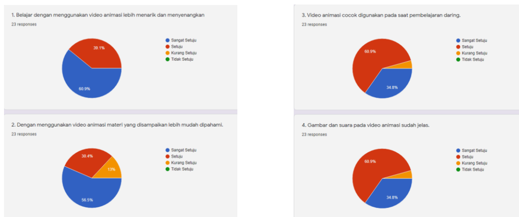
Figure 2: Questionnaire Results

The learning delivered by educators online also needs to know the results of the learning so that educators can improve the way of learning in the future. Therefore, there will be results using a questionnaire) in research so that researchers know the results of learning using animated video media in Natural Resources activities for class IV. From the results of the questionnaire in the form of a google form, you will know who has filled out the questionnaire. The following are the results of the study using a questionnaire using the google form.