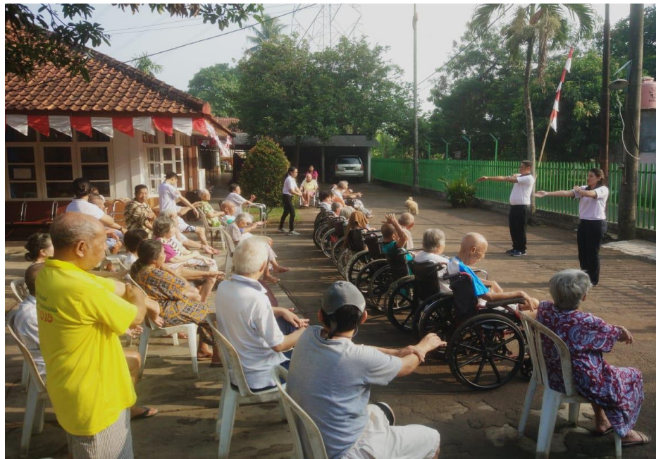
Figure 4. Hypertension gymnastic