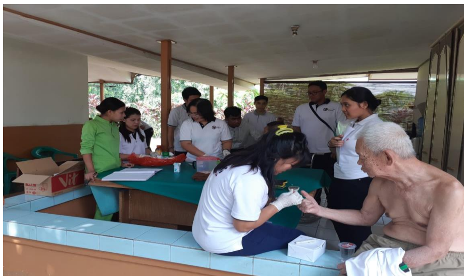
Figure 2. Blood Sugar, Cholesterol and Uric Acid Checking

The evaluation was led by the head of community service. In a nutshell, all activities under this program went well. As many as 66 elderly people underwent health checks which included blood pressure, blood sugar, and cholesterol. Meanwhile, 34 other people had undergone an examination the day before this activity was carried out, which was on September 3, 2019. It was found that among 66 respondents, 19 had increased blood pressure, 1 had increased blood sugar and 13 people had a high cholesterol. The evaluation results also show that the elderly, nurses, and employees have understood the ways of doing hypertension exercise and they decide to continue doing it every morning as an additional activity for the elderly.