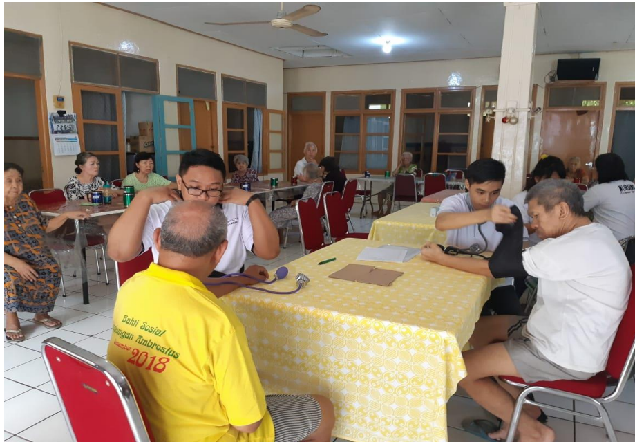
Figure 3. Blood Pressure Checking