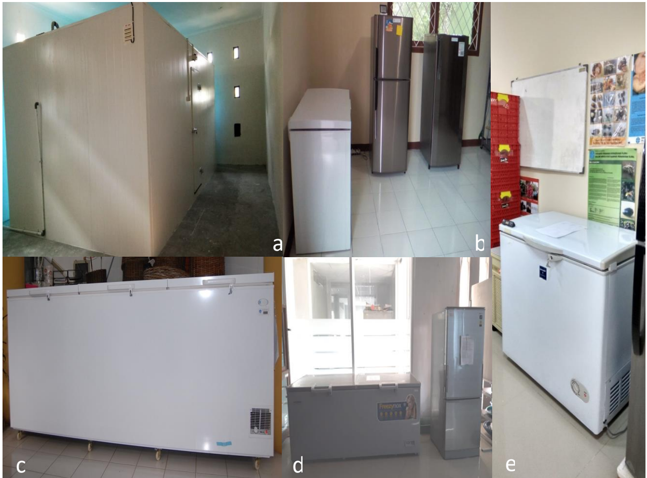
Figure 1. Facilities in seed banks of national botanic gardens under LIPI (a) cold storage in Bogor Botanic Gardens, (b) freezer in Cibodas Botanic Gardens, (c) freezer in Bogor Botanic Gardens, (d) freezer in Purwodadi Botanic Gardens and (e) freezer in Eka Karya Bali Botanic Gardens

means that the seed collection is distributed and used for research, reintroductions, and seed exchange based on orders, needs and requests.