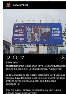
Figure 11 Didi Kempot's advertisement as Shopee's brand ambassador.

"At the beginning of last year we, from the Didi Kempot region-2 fan network, have just collaborated with Shopee because Lord Didi is Shopee's brand ambassador." (Admin @Sobatambyar.cikarang)