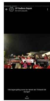
Figure 5 The Srikandi of Didi Kempot who also enlivened all of Sobat Ambyar's activities.

In addition to post photos and videos, Sobat Ambyar also strives to continue to spread interest through various interesting, funny, and viral content on social media. Like karaoke, song covers, to Ambyar quotes. With this trend, Sobat Ambyar is active on social media and involved in off-air activities. One of them is