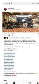
Figure 3 Gathering between Sobat Ambyar throughout Indonesia. Source: Research document (screenshot Instagram @sobatambyar).