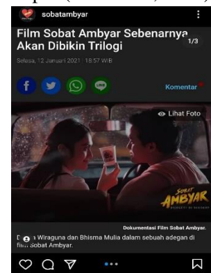
Figure 14 Information from Kompas that the Sobat Ambyar film will become a trilogy.