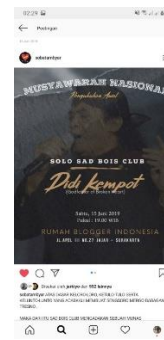
Figure 4 National conference for sadboys and sadgirls inauguration.