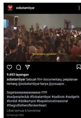
Figure 13 Initial information on the filming of Sobat Ambyar.