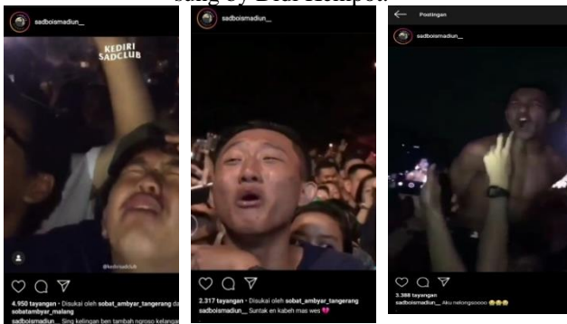
Figure 10 A collection of Instagram posts showing the crying and sadness of male audience during concerts.