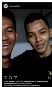
Figure 8 Cover song by Didi Kempot.

One way to understand popular culture is to see it as uncertain, relative, volatile, and ultimately easy to imitate. This even includes art and morality, which are usually considered more rigid. One proof that a phenomenon is regarded as popular culture is when the public can accept the phenomenon on a large scale. Although some of the audiences of this phenomenon do not understand the content and message conveyed. In Sobat Ambyar's fandom, the message you want to convey is a deep hurt, which adults usually feel. However, in Sobat Ambyar, this is no longer