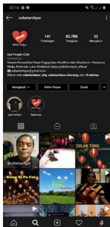
Figure 1 @sobatambyar account uploading things related to Didi Kempot