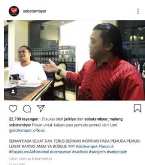
Figure 2 @sobatambyar account Uploading Didi Kempot's daily activities