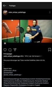
Picture 7 Cover song of Tatu by Didi Kempot.