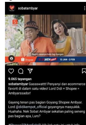
Figure 12 Shopee ad featuring Didi Kempot.

By involving Sobat Ambyar, the event organizer and the brand owner's targeted segmentation will be right on target. Because of their admiration for Didi Kempot, Sobat Ambyar will automatically share information about Didi Kempot. As a result, Sobat Ambyar will also loyally buy concert tickets and products using Didi Kempot as their icon. The parties working with Sobat Ambyar often hold challenges, give away presents, and various activities involving interaction with Sobat Ambyar. In these various activities, Sobat Ambyar must follow several