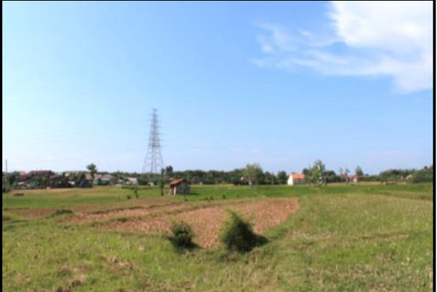
Figure 1. Aerial Photo of Agricultural Land in Rembang