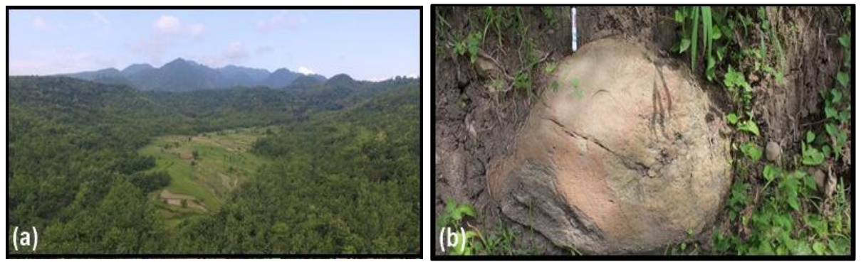
Figure 5. (a) Landscape in Moderately Dissected of Volcano Slope (Source: Maulana 2016) (b) Andesite Outcrops in Land (Source: Maulana 2016)

The moderately dissected of volcano slope (IV-b) occupy more than 20% of the area in this study (Table 2). The major limiting factor was gravel/rock. These area not suitable for agriculture due to moderately steep slope, 10-50% outcrops, and slighty soil depth (Figure 5). Agricultural land just being in the mountains valley with gently sloping.