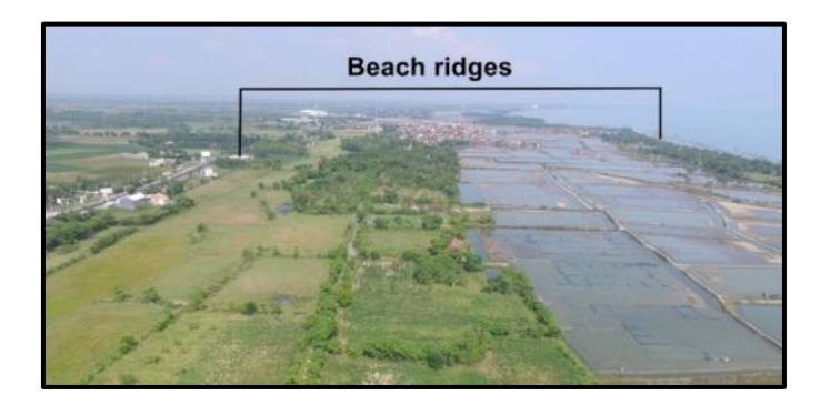
Figure 6. Land use existing in beach ridges (II-Old)

Land capability class II-Old located in beach ridges specifically inactive ridges. There are general relationships among the geomorphic units and land class in plains (Atalay 2016), included in beach ridges landform. Characteristics of beach ridges were gently sloping, silty clay texture in up and bottom soil layers, platy soil structure, and soil depth more than 90 cm. These characteristics enable moderate drainage and permeability so suitable for croplands or fishponds but still has moderate limitations that restrict the choice of plants. Land use existing in beach ridges is settlements, fishponds, and croplands (Figure 6). These was according to a statemant from Verstappen (2013)that beach ridges generally used for settlements and yards. Based on land characteristic and land capability, beach ridges (II-Old) directed as cultivation area. However, land utilization should be able to overcome the limiting factors, such as flood, slope, and drainage. It's asses to sustainable usage.