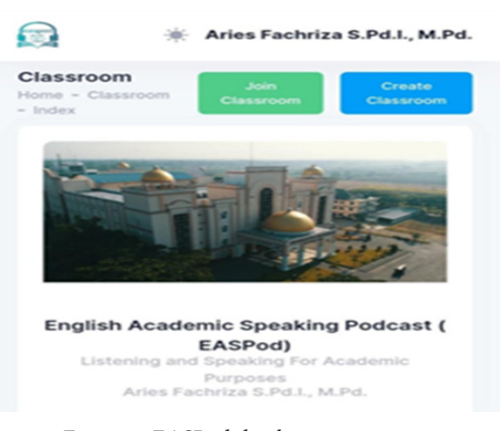
Figure 1. EASPod display in computer

activities that emphasized to students' fluency and pronunciation (Baratova, 2023). This will assist the listener to identify the word or sentence by podcaster.