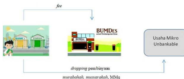
Figure 2. Scheme 2 Islamic Bank Synergy

These two efforts are able to drive BUMDes businesses, while the community is assisted in obtaining funds for business capital needs.