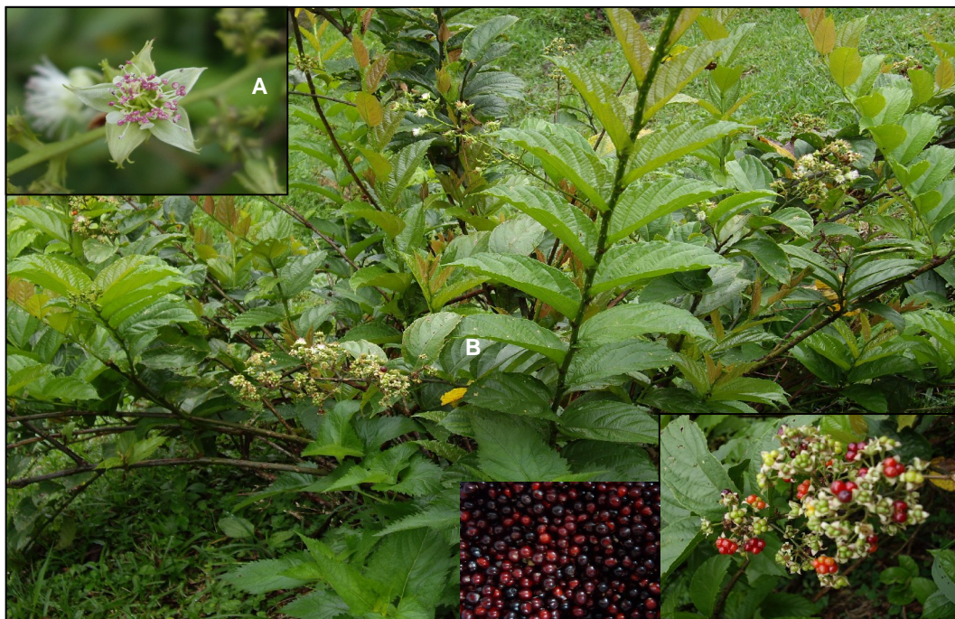
Figure 1. Rubus pyrifolius (A). flowers, (B). fruits

Randomized complete block design with two factors and three replications were used in this experiment. The first factor was fourth type of planting media, i.e. A. sand + husk (2:1), B. sand + compost (1:1), C. compost + husk (1:1), and D. compost. The second factor was without compound fertilizers and three types of compound fertilizers i.e. Gandasil D (20%N–15%P–15%K), Hyponex (25%N–5%P–20%K), Growmore (10%N–55%P–10%K). The dose of compound fertilizers given to the seedlings was 1 g/lt. Compound fertilizers were applied five times, namely at the day of planting, 2 weeks after planting, 4 weeks after planting, 6 weeks after planting, and 8 weeks after planting.