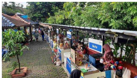
Figure 1. Seller's booth in Bendhung Lepen