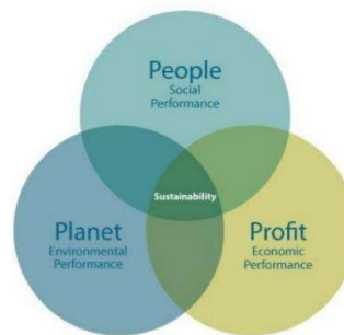
Triple Bottom Line