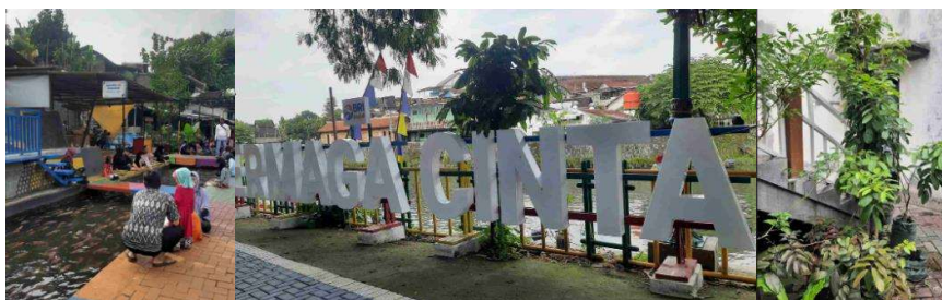
Figure 2. Bendhung Lepen attractions (left), Dermaga Cinta (center), and Kampung Kelengkeng (right)

Profit is often associated with the economy because river ecotourism is expected to bring benefits to the community (Elkington, 1998). Communities use natural resources to gain profits in order to meet their needs. Some of the tourist attraction objects (ODTW) offered in the Giwangan Village are the Bendhung Lepen Tourism Object, the Love Pier, and Kelengkeng Village. The Bendhung Lepen Tourism Object offers the attraction of the number of fish cultivated in irrigation channels and adequate facilities so that it is comfortable to be used as a place for recreation with family, friends and others. While the tourist attraction "Dermaga Cinta" has an attraction from the riverside which is offered by using boats and ships that have interesting shapes. Meanwhile, the "Kampung Kelengkeng" tourist attraction offers a tourist attraction in the form of education related to the cultivation of longan plants in narrow urban areas, the use of roadsides, and the benefits of longan plants. Of the three ecotourism, there is no entry ticket (free), only parking fees are charged sincerely.