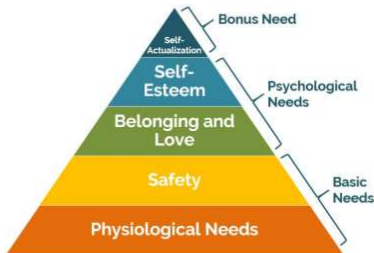
Figure 2. Maslow's hierarchy of needs

Thus, individuals and organizations involved in tourism activities must take appropriate corrective actions to improve the aforementioned difficult situation.