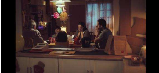
(2.1.A) Waiting for father.

advertisements give the desired message of happiness and warmth of the family circle in the video commercial by identifying the visual expressions that McDonald's depicts in its video advertising emphasize the family circle. The conclusion discusses how context, clothes, colors, gestures, and facial expressions all contribute to the concept of pleasure in the context of a family.