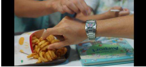
(4.5.A) Stay longer. Stay with me through the day.

the struggle alone. There will be someone who accompanies us. In that scene, the daughter feels happy with her mom's attendance while eating. Some people do not like eating alone. They struggle to maintain their mood, but with other people's support, they feel like that is the best time ever. To conclude, attention from someone during their hard time is the key to happiness.