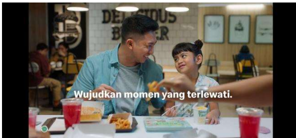
(4.6.A) Time spending.

The fourth McDonald's commercial has a song for the entire video. The video is about a big brother who has not come home for a long time and finally got time to spend with his little sister. Sadly, one day is not enough. The song is like, "Stay with me through the day." In scene 4.5.A the piece represents how they need each other to accompany. The story takes one day, so the little girl needs her brother to stay through the day, not days. In a different meaning, the song with the scene picture about twenty-four hours a day is not enough 'I need you to stay longer. That is why a butterfly sticker covers the father's watch. Like the other McDonald's commercial, happiness in this video is about togetherness. Another joy in this video is the unlimited time spent with family members.