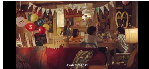
(2.2.B) Family ritual.

In 2.1.B, we can see only five people in the scene, which means they are missing one figure, the father. The confused little girl asks her family member about her father's appearance. Their expressions are like they do not know where the father is. In the next scene, 2.2.B, we can see the complete version where the father has already come. When the family is whole, they look happy. The smile on the family member's face with warm tone color makes the scene look so delighted and heartwarming. Not only that, we can also see that they are happy to be a complete family and praying for it together. The clothes they wear in this scene create 'home' feelings. They are worn not too fancy or extra, a simple t-shirt or polo shirt with warm tone color. This scene represents the idea of happiness, gathering with complete family members.