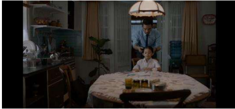
(5.1.B) Busy. In the morning, to start the