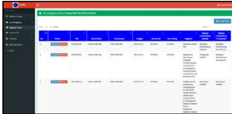
Figure 4. Interface Student Activities

To obtain a feasibility study from the fieldwork practice information system, testing was carried out using calculations from black box testing as many as 45 questions to 6 respondents, the following results were obtained: