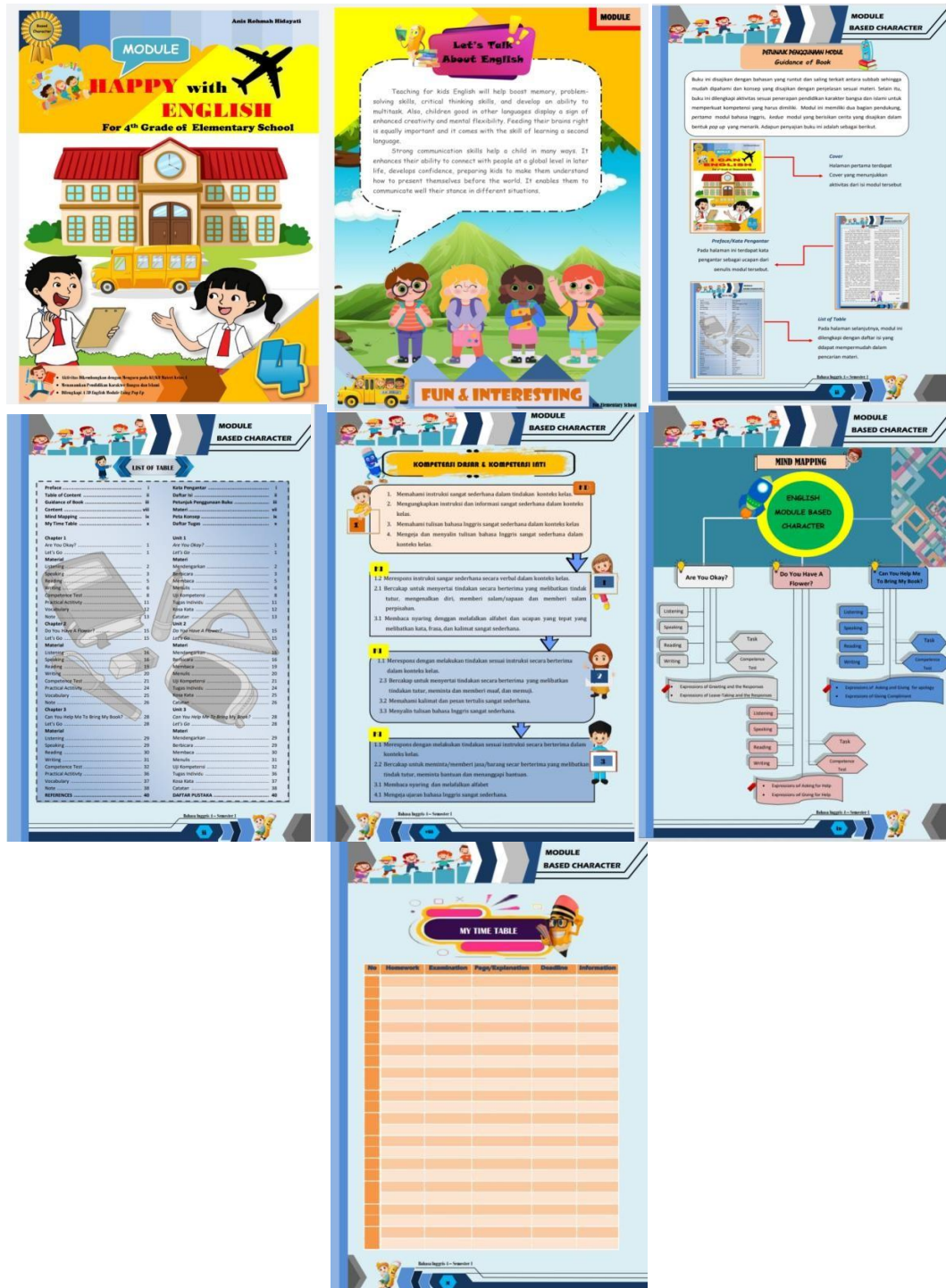
Figure2. The Pre-activity content of English module

understanding. All the compositions on the module are organized in accordance with the layout, so they are balanced on the matter with other compositions. Description of the contents of the module using A4 paper using Calibri, Times New Roman and Comic Sans fonts in sizes 11,12, and 14. The Pop Up book use Calibri and Comic Sans fonts with sizes 12, 13, 14, and 16. Using A4 paper, that kind of paper is ivory. any part of the contents of books and pictures in design attractively. When children read the material, they are not tired or bored.