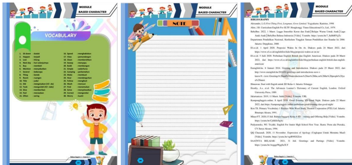
Figure 4. The post-activity content of English module