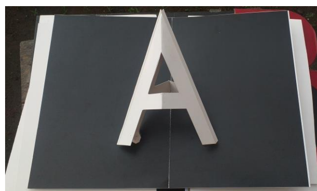
Figure5. The pop up book