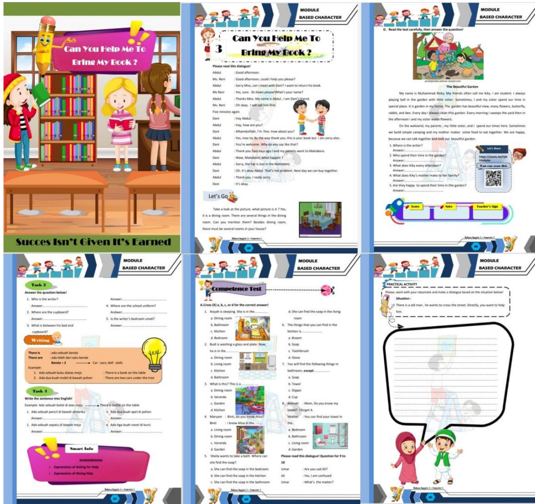
Figure 3. The main activity content of English module