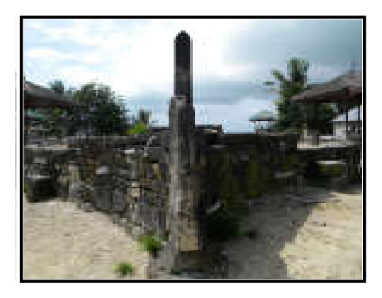
Figure 3. The stern of a stone boat monument at Sangliat Dol

somewhat to the rear, the village owner had a seat on the left and the sacrificer sat on the