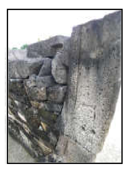
Figure 4 (left) and 5 (right). Decoration on the left and right side of the prow of stone boat monument at Sangliat Dol