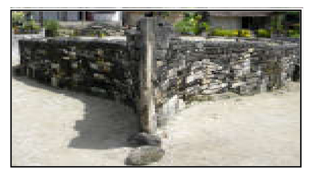
Figure 2. The prow oa a stone boat monument at Sangliat Dol

Naditira Widya Vol. 4 No. 2/2010- Balai Arkeologi Banjarmasin