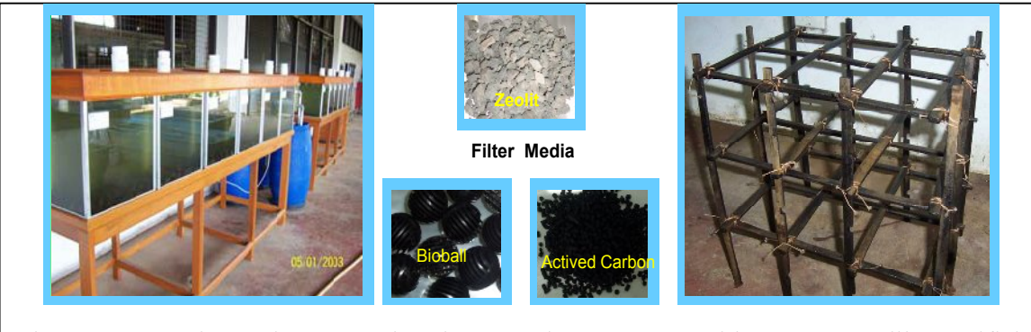
Figure 1. Experimental Prawn Closed Aquaculture System with Apartment like Artificial Shelter

A complete random design was applied in this experiment (4 treatments with 3 replications). Giant freshwater prawn seeds with average length of 6.54 + 0.27 cm and average weight of 2.32 \pm 0.24 g were used to stock the aquaria according to the treatments, which were 5, 10, 15, and 20 prawns per aquaria. These densities are equivalent to 50, 100, 150, and 200 prawn/m<sup>2</sup>, respectively. The prawns were then cultured for 75 days. The lowest stocking density of 5 prawns/aquarium (50 individuals/m<sup>2</sup>) was set above those of traditionally prawn culture conducted by local farmers around Bogor which usually stock 15 individuals/m<sup>2</sup> of the same size prawns.