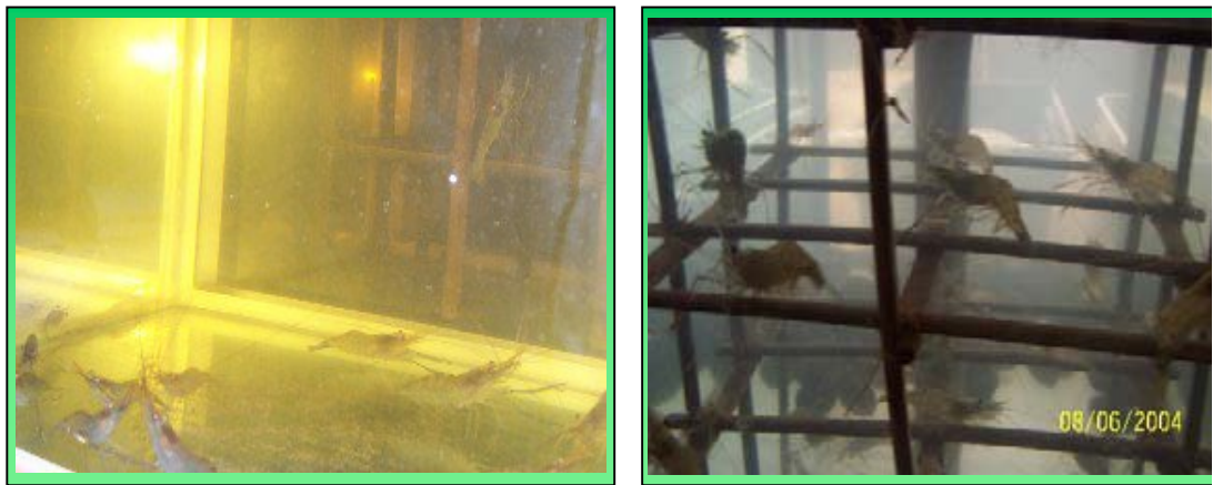
Figure 2. Prawn Response to the Presence of Artificial Shelter. Left is Prawn Without (A) and Right with Shelter (B)