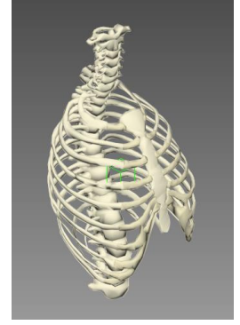
Fig. 4. Sternum 3D Object

The Sternum 3D Object created later is shown above the marker when the application successfully identifies marker_b. The following is a 3D object figure of the sternum