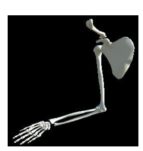
Fig. 9. marker_c 8. Marker_d

When marker_c was identified by the application, the application projected a three-dimensional object from the bone of the upper motion tool above the marker and if marker_c was removed from the camera's range, the three-dimensional object of the upper bone motion tool would disappear from the marker