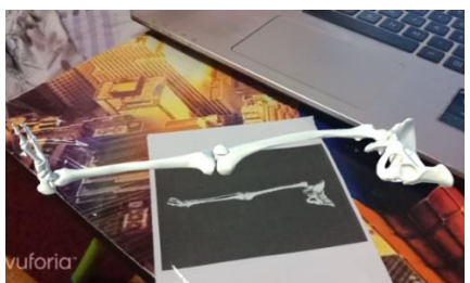
Fig. 14. Display marker_d scan result

When the application managed to recognize the marker_d pattern, the application projected the three-dimensional object of the lower tool bone above the marker. Following is the display image when the three-dimensional object of the lower motion tool was projected above marker_d.