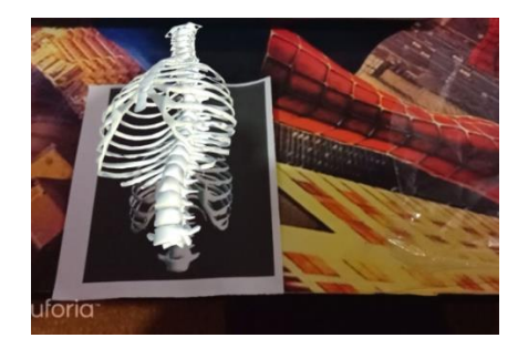
Fig. 12. Display marker_b scan result

When the application successfully recognized the marker_b pattern, the application projected a three-dimensional object of the spine and ribs above the marker. The following is a display image when a three-dimensional object of the spine and ribs was projected above marker_b.