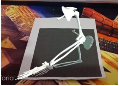
Fig. 13. Display marker_c scan result

When the application successfully recognized the marker_c pattern, the application projected the three-dimensional object of the upper motion tool above the marker. The following is a display image when the three-dimensional object of the upper motion tool was projected above marker_c.