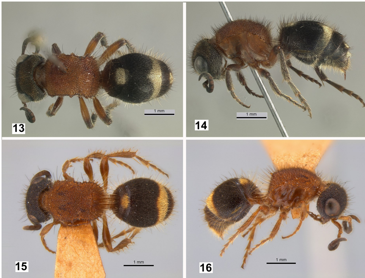
Figures 13-16. Photographs of : 13, 14. Bischoffitilla saffica , female; 15, 16. B. selangorensis , female; 13, 15. Habitus, dorsal view; 14, 16. Habitus, lateral view.