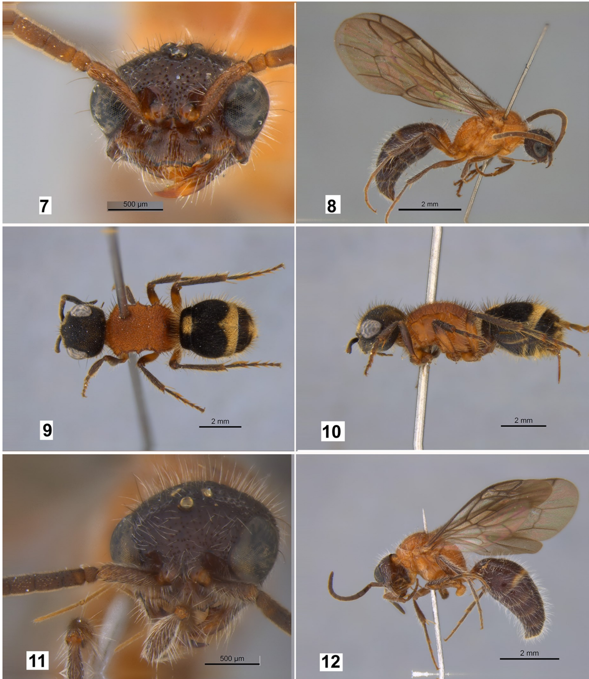
Figures 7-12. Photograph of: 7, 8. Bischoffitilla muiri , male; 9, 10. B. multidentata , female; 11, 12. B. palaca , male; 7, 11. Head, frontal view; 8, 10, 12. Habitus, lateral view; 9. Habitus, dorsal view.

Diagnosis. FEMALE. Propodeum slightly serrate, without a transverse row of long, vertical teeth at the junction of the posterior and dorsal surfaces. Median spot on metasomal tergum 1 and apical band of metasomal tergum 2 white. Propodeum dorsally