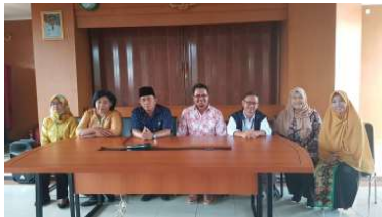
Figure 3 The Implementation of Socialization Program

Besides, ownership-based on Figure 2 ownership of Islamic bank accounts is only owned by housewives aged 36-45 years. This shows that not many homemakers have accounts from Islamic banks, which is 10% of the total homemakers present at the socialization program (table 4). The outreach activities went well, and all participants responded that the E-Commerce outreach program to help sell their products and services was very useful. Empowering homemakers who have hobbies and can commercialize their products and services that aim to increase their sales turnover and need to improve the quality and appearance of the packaging of products and services as portrayed on Figure 3.