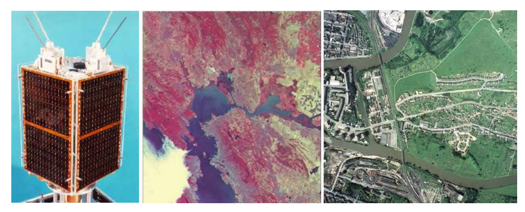
Figure 2-1. TM-sat and its image result (San Francisco bay), and Theoss-1 image result (Vongvivatanakij, 2008)

After the decommissioning of Theos-1 in 2014, GISTDA plan to establish the 2<sup>nd</sup> Thailand's remote sensing satellite, i.e. THEOS-2. The plan, however, were delayed for few years, so that until now the subsequence satellite has not been launched (GISTDA, 2017).