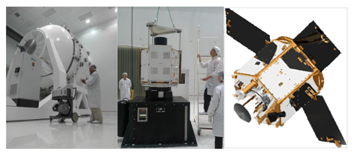
Figure 2-2. Malaysian 1-ton class satellite integration facility and Razaksat-1 (ATSB, 2014)

Second remote sensing satellite developed by Malaysia is RazakSat-1. For its development, ATSB built satellite integration and test facilities in Malaysia (see Figure 2-2). The payload of the 180 kg satellite was developed with the assistance of Korean company SatReci (Kim et. al, 2003). The satellite imagers have resolution of 2.5 m (panchromatic) and 5 m (multispectral), with swath of 20 km, and was launched to near equatorial (low inclination) orbit as dedicated launch by SpaceX in 2009.