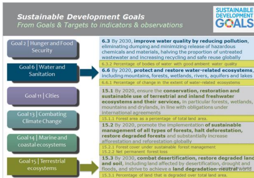
Figure 3.2 Several indicators which could be measured with remote sensing data.

directly (or indirectly) to the production of these indicators. Several of the indicators are shown in Figure 3.2. These are considered priority indicators for GEO, particularly those that are categorized as Tier III (indicators with no established methodology or standards, but are being or will be developed and tested) and as Tier II (indicators with an established methodology but the data are not regularly available in all countries).