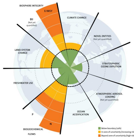
Figure 3.1 Planetary boundaries.

At the end phase of MDGs, UN member states prepared for the post-2015 development agenda with desire for change. European Union proposed the concept of ‘planetary boundaries’ at Rio+20 Summit held in 2012, commemorating two decades of its first meeting. According to the Stockholm Resilience Centre who introduced the concept as shown in Figure 3.1, there have been identified five out of nine boundaries been crossed.